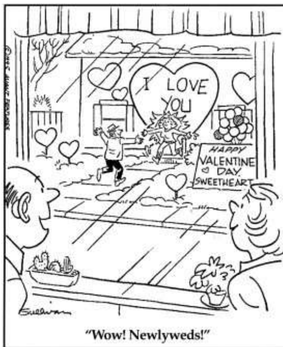
from The Joyful Noiseletter ©1997 Ed Sullivan Reprinted with permission