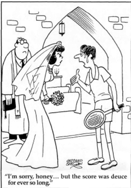
from The Joyful Noiseletter ©Goddard Sherman Reprinted with permission