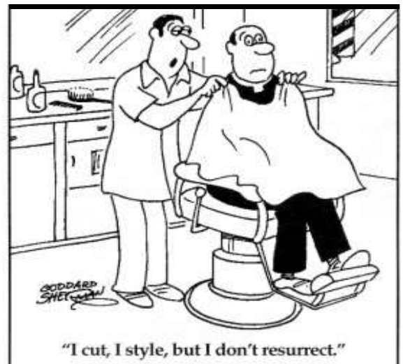
from The Joyful Noiseletter ©1997 Goddard Sherman Reprinted with permission